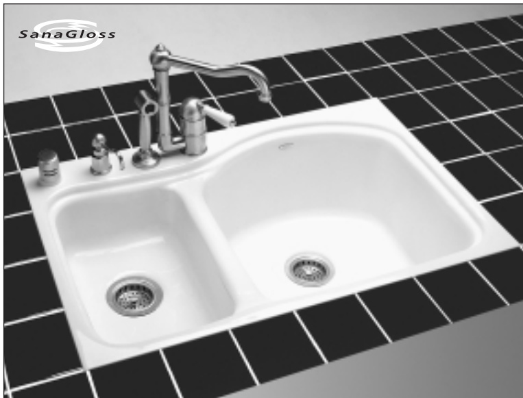
FSW460GT.4 Forrester Cast Iron Kitchen Sink