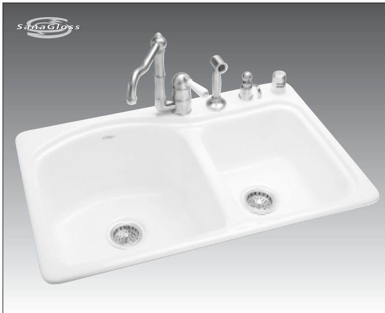
FSW420GS.4 Bridgeport Self-Rimming Cast Iron Kitchen Sink